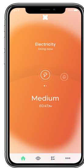
geo Home app